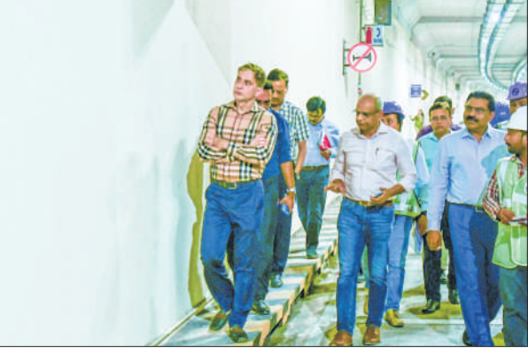
SHEFALI PARAB-PANDIT / MUMBAI

The Coastal Road tunnel leakages were repaired on a war-footing by Friday. Civic officials said currently there is no active leak inside the southbound stretch. The civic authorities have instructed Larsen and Toubro (L&T) to use polymer grouting in all the 25 expansion joints in the tunnel. Meanwhile, the civic body has also clarified that the structure is absolutely safe and there's no cause for panic.