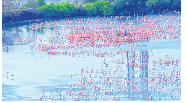
RAINA ASSAINAR / NAVI MUMBAI

Days after 39 flamingos were blown to smithereens while in the path of an Emirates aircraft, green groups have written to Chief Minister Eknath Shinde about drones posing danger to the birds around the sensitive DPS Lake in Navi Mumbai.